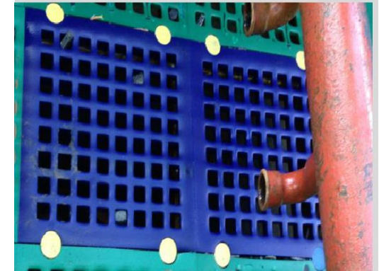
Blue Screen Panel