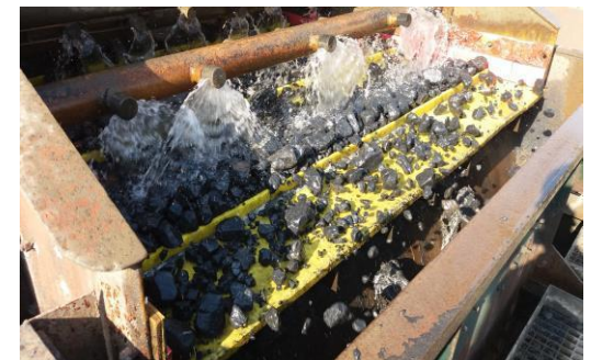
Chrome Ore Drain and Rinse Screen